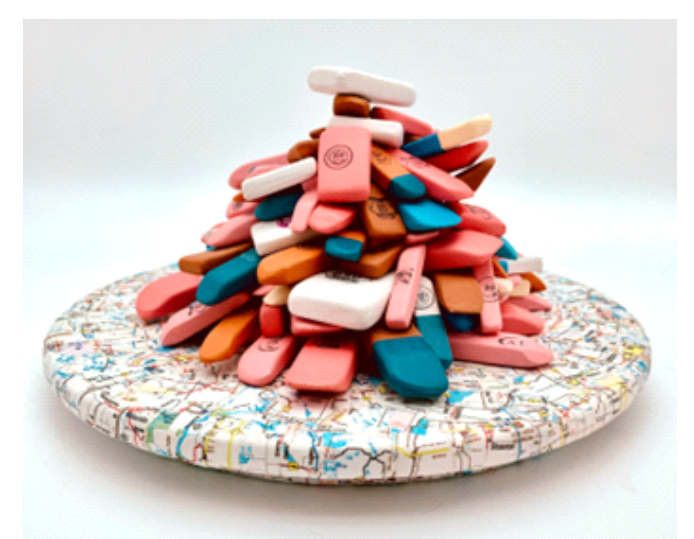
Erasure is Futile, 2021, mixed media sculpture (collaged map, casted erasers), collection of the National Centre for Truth and Reconciliation (Winnipeg)

"My family has experienced the erasure this work is talking about ... there was a lot of disconnect on my father's side of the family. And it's taken a long time for us to piece together exactly what happened during that time period and in our family."