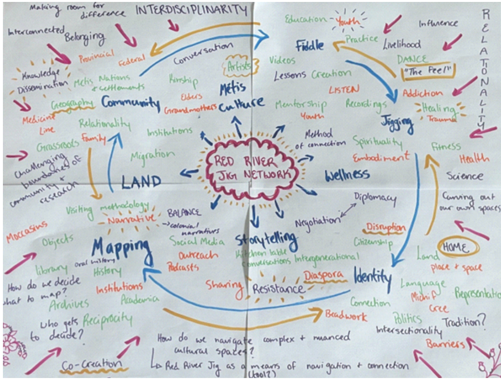
Figure 5: Lily Overacker's visualization of the project. The idea was to represent how the Red River Jig Network can interact and build relationships with different spaces and places of knowledge and community while also showing that these ideas and spaces have the capacity to interact and speak back to us and/or through us.