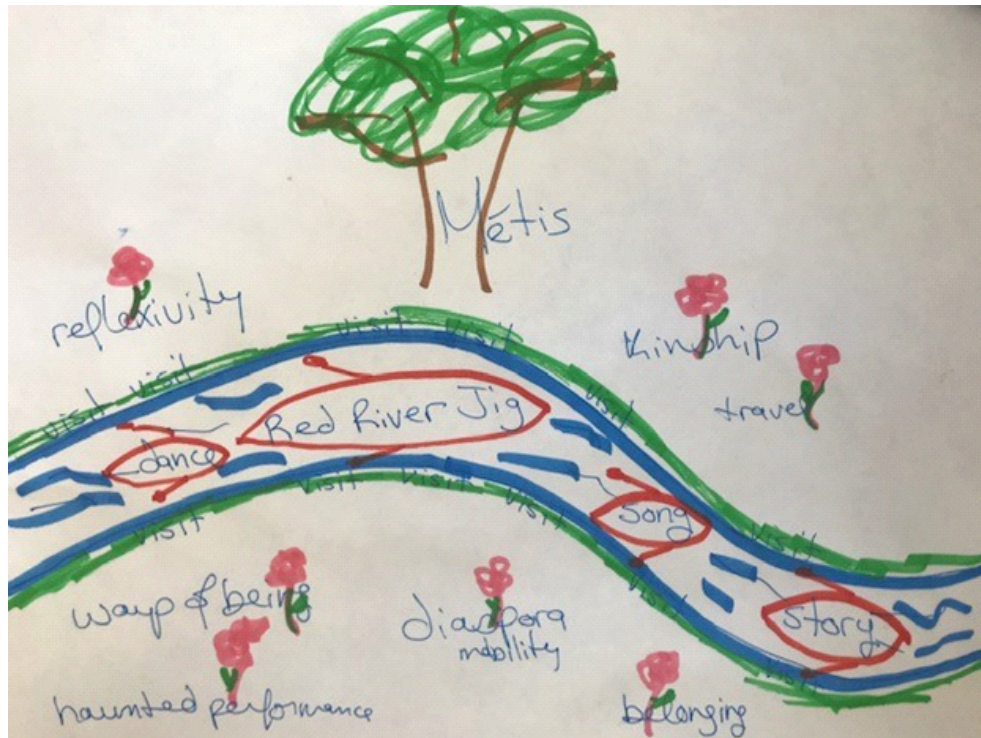
Figure 3: Dr. Porter's visualization of the project. The river carries the music, dance, and story. On the banks of the river grow the Métis people and culture.