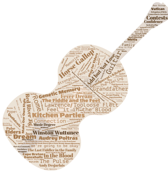
Figure 8: Word cloud of our visit with Kusturok and Lizotte